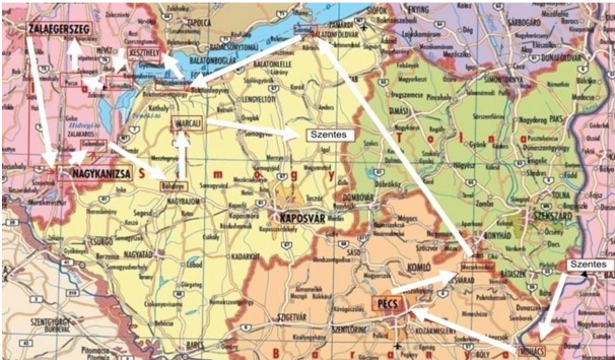
Figure 5: Roundroad